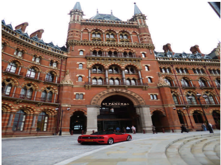
Figure 3 St. Pancras Hotel, London, UK

hardware and information on FAA NextGen compliant avionics products that support Automatic Dependent Surveillance-Broadcast technology. The St. Pancras (Figure 3) was built around the rail station, the hotel looks like a fairy-tale castle straight out of Disney World. It opened in 1873 and was built in the Venetian Gothic style.