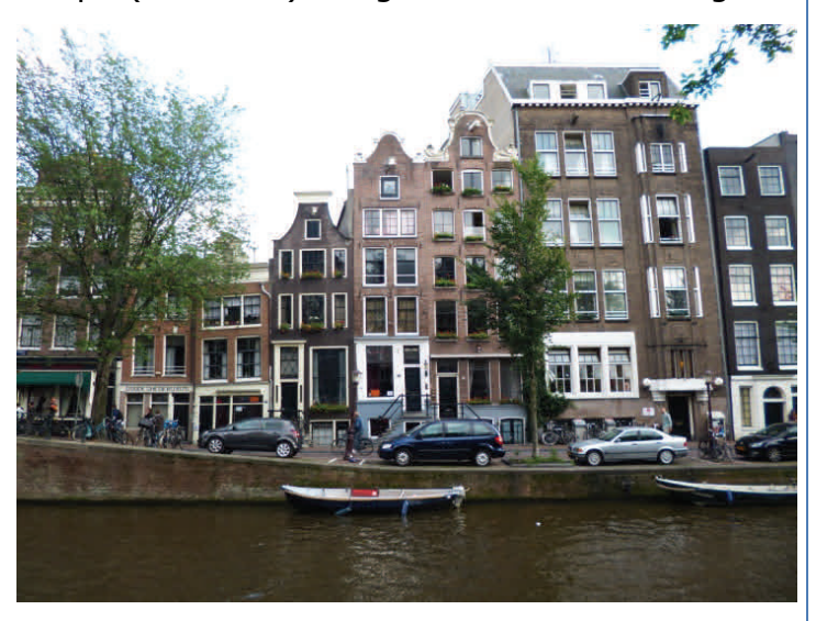
Figure 7 Amsterdam Houses

Amstel River, see Figure 7. It is an Old Dutch design wooden bridge known as a double-swipe (balanced) bridge. The current bridge