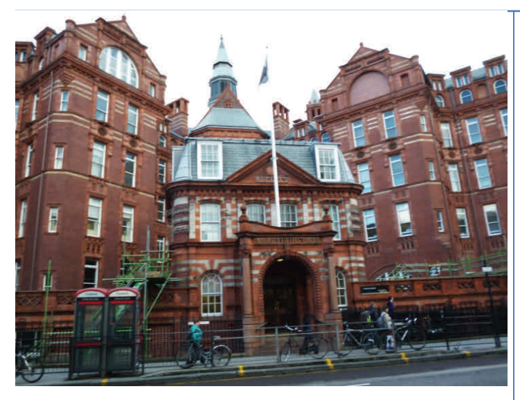
Figure 4 University College London

display. His body was preserved and is kept at the University College of London (UCL) in a wooden cabinet, modestly and precisely labeled "Jeremy Bentham." The body as such is not visible, since it is clothed and the head has been removed and replaced with a wax one. Pretty creepy if you ask me.