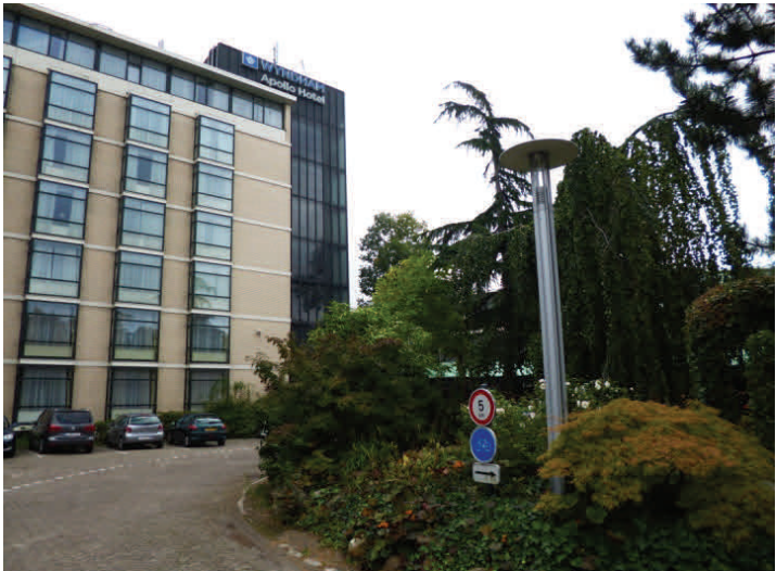
Figure 6 Wyndham Apollo Hotel, Amsterdam, NL

Travel on Friday 20SEP, included a return from Southampton to the London Waterloo station, underground (subway) to Heathrow Airport, a flight to Amsterdam, Netherlands and a shuttle to the Wyndham Hotel (Figure 6) which near the location for the IEEE Sections Congress meeting at the RAI Convention Center, Amsterdam has a great Metro rail system that operates above ground due to the high water table in the Netherlands. Several hotels were surveyed and proposals were received prior to the Amsterdam visit. The Wyndham Apollo Hotel was selected based upon the meeting facilities and location of 1.8 kilometers ( about a mile) from the RAI Convention Center.