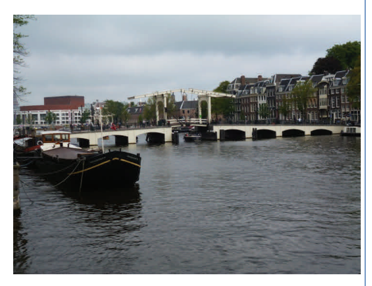
Figure 8 Amstel Bridge, Amsterdam, NL

The houses (Figure 8) in Old Amsterdam are so narrow because lots sold by the city during the early days of Amsterdam were only 5.5 meters (about 18 feet) wide. The houses built then are supported by 36 foot tall wooden pilings sunk into the soil. As long as these piling stay submerged in water they will not rot because they have no contact with the air. Some of the houses are leaning because not enough pilings were used for support. Modern houses are supported by concrete piling.